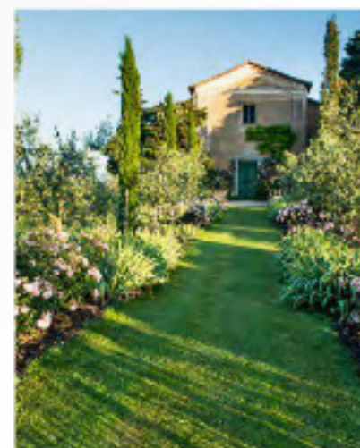
Top: Portrait Roma's rooms offer balcony views (top). The gardens of Palazzo Parisi (above). Contemporary style at Villa Nocetta (below)

The Villa Medici suite, with a double bedroom, costs from €1,280/€910 a night. The Trinità dei Monti suite, which sleeps four, is from €1,760/€1,251. Two suites can be joined to accommodate six (0039 06 6994 2219; lasceltadigoethe.com ).